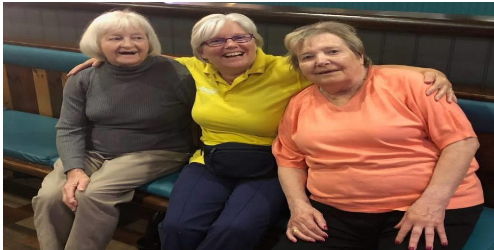
Bowling followed by lunch at Frankie & Benny's!