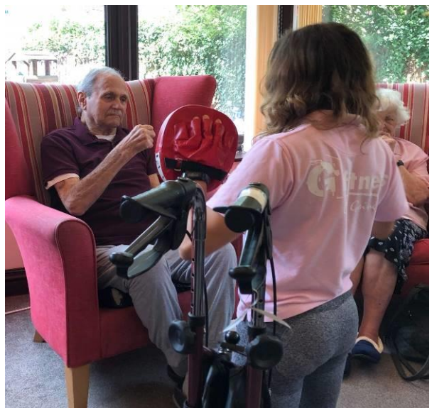
Keeping Fit with a bit of boxing.